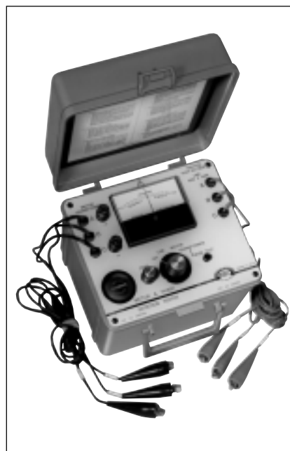
Rugged enclosure includes storage space for test leads.

Select a second group of leads. Determine the common terminal and rotation in the same manner as described above. In tagging these terminals, the prefix number is temporarily omitted. The terminals are tagged A, B, C. If done properly, B will mark the common lead. At this stage, the identification of terminals has reached the point shown in the figure. It remains to be determined whether this second group belongs in the 2 or 3 position. This can be determined by an induced voltage test that