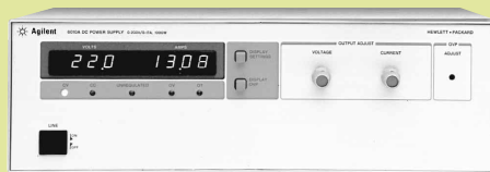
6010A, 6011A, 6012B, 6015A