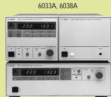
6030A, 6031A, 6032A, 6035A

Save rack space by using fewer outputs Reduce cost by using fewer power supplies