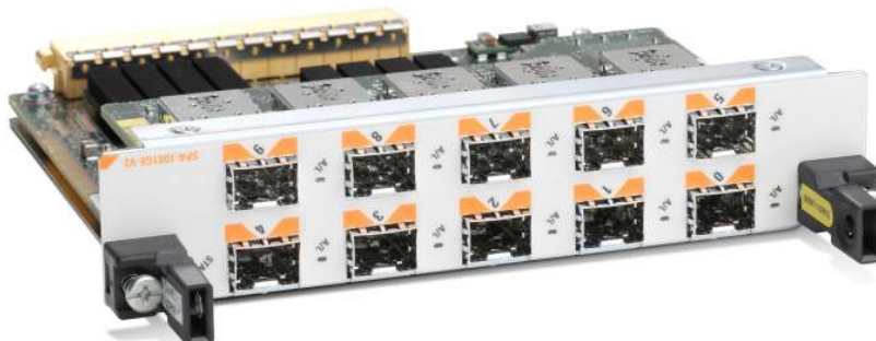
Figure 1. Cisco 10-Port Gigabit Ethernet SPA

The Cisco® Interface Flexibility (I-Flex) design combines shared port adapters (SPAs) and SPA interface processors (SIPs), taking advantage of an extensible design that helps enable service prioritization for voice, video, and data services. Enterprise and service provider customers can take advantage of improved slot economics resulting from modular port adapters that are interchangeable across Cisco routing platforms. The Cisco I-Flex design maximizes connectivity options and offers superior service intelligence through programmable interface processors that deliver line-rate performance. Cisco I-Flex enhances speed-to-service revenue and provides a rich set of quality of service (QoS) features for premium service delivery while effectively reducing the overall cost of ownership. This data sheet contains the specifications for the Cisco 2-, 5-, 8-, and 10-Port Gigabit Ethernet Shared Port Adapters, Version 2 (Figures 1, 2, and 3).