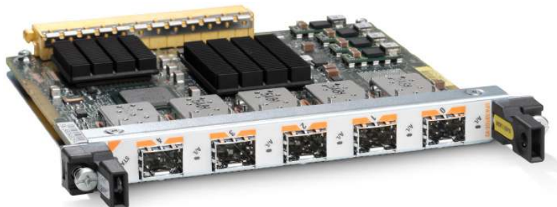
Figure 2. Cisco 5-Port Gigabit Ethernet SPA

The Cisco 2-, 5-, 8-, and 10-Port Gigabit Ethernet SPAs are available on high-end Cisco routing platforms, offering the benefits of network scalability with lower initial costs and ease of upgrades. The Cisco SPA/SIP portfolio continues the company's focus on investment protection along with consistent feature support, broad interface availability, and the latest technology. The Cisco SPA/SIP portfolio allows deployment of different interfaces (Packet over SONET/SDH [PoS], ATM, Ethernet, etc.) on the same interface processor.