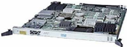
Figure 2. Cisco 12000 Series 16-, 8-, and 4-Port OC-3c/STM-1c POS ISE Line Cards