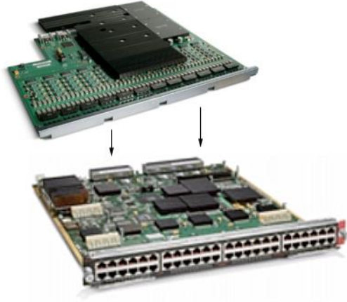
Figure 7. Cisco Classic 96-Port 10/100 802.3af PoE Module (part number WS-X6148X2-45AF)